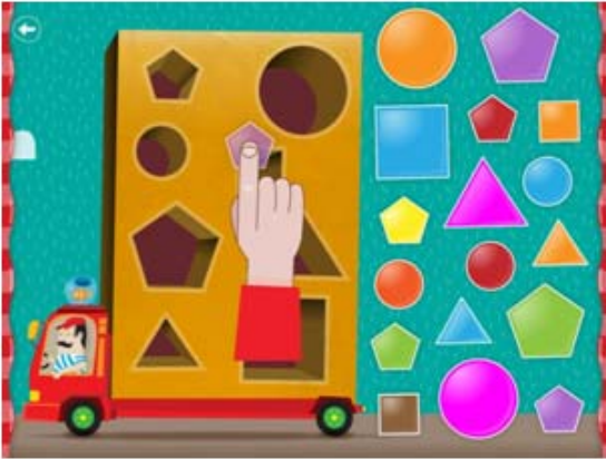
Figure 1—Animated hand game instruction [28].

to choose words that are appropriated to users reading levels and to use large font size [25]. On the other hand, animation demonstrations and audio guidance were considered largely appropriate for preschoolers. Figures 1 and 2 show examples of animation instructions. In the Figure 1 an animated hand demonstrates the action the children should perform in the game. In the Figure 2, an animated character (squirrel) shows the player the correct answer.