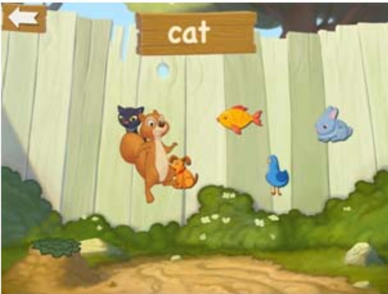
Figure 2—Animated character game instruction [29].

In relation to visual state change, results show that it was effective in calling attention to interactive items, but not as a teaching tool (demonstrating how users should touch items) [27]. These previous studies indicate that in a serious game that focus on children from a vast age range, the best strategy is to combine different types of instructions, initially combining audio with animations and visual state changes and, as children’s literacy improves, start including also text instructions.