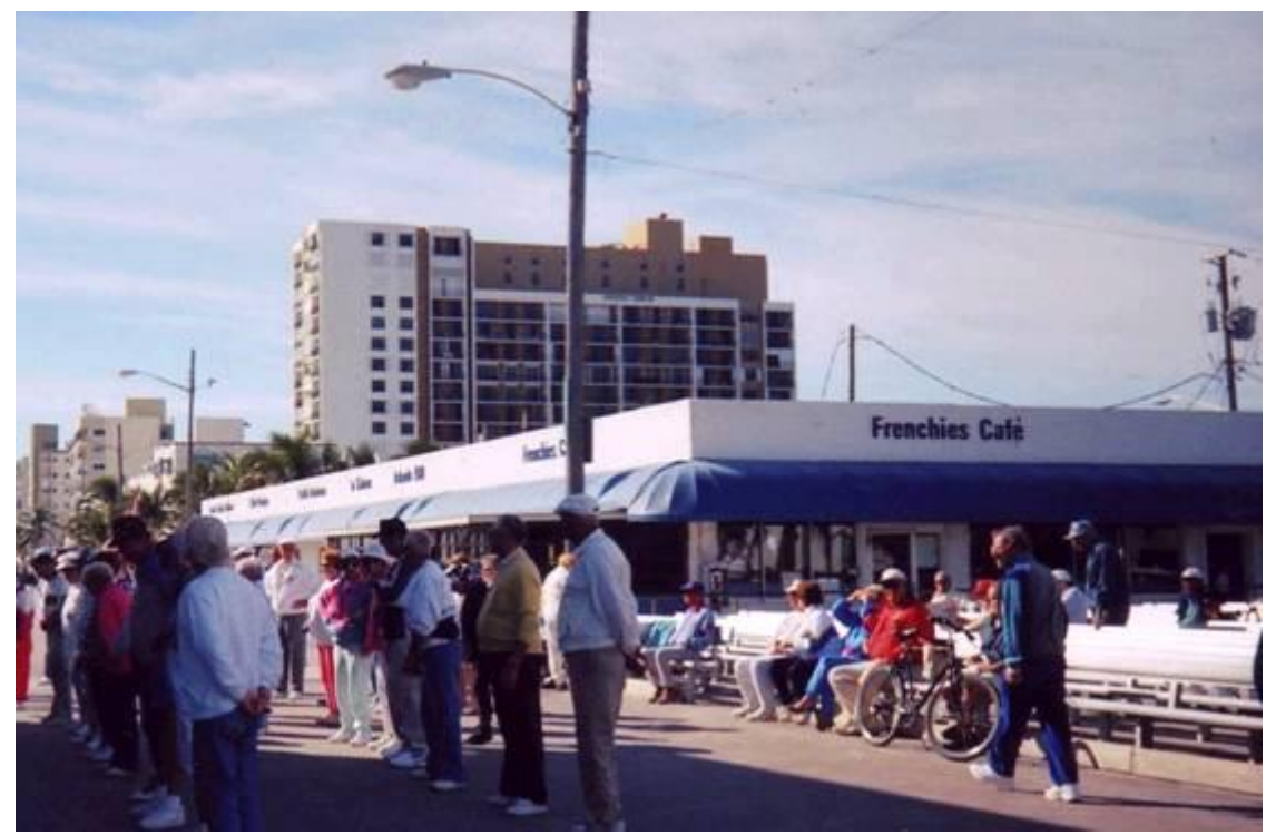
Figure 3: Frenchie's Café (now demolished) was the heart of Floribec's recreational business district (RBD). Photograph by Rémy Tremblay, circa 1994

Miami's personality as an open seaside resort is urban and multipolar, and as such, it has a definite potential for renewal and adaptation to trends such as retired persons and the development of integrated hotel resorts (Lozato-Giotard 2008, 206), which also spells urban sprawl and population densification resulting in and depending on the concreting of the waterfront. Miami Beach and Dade county offer a typical historic example of such absent-minded development from the 1920s on, whereby already in the 1950s 'virtually every ocean front hotel had already run bulkheads, lines of cabanas or groins which fenced in their beaches' (Steinberg 1997, 427; see also Lozato-Giotard 2008, 231).