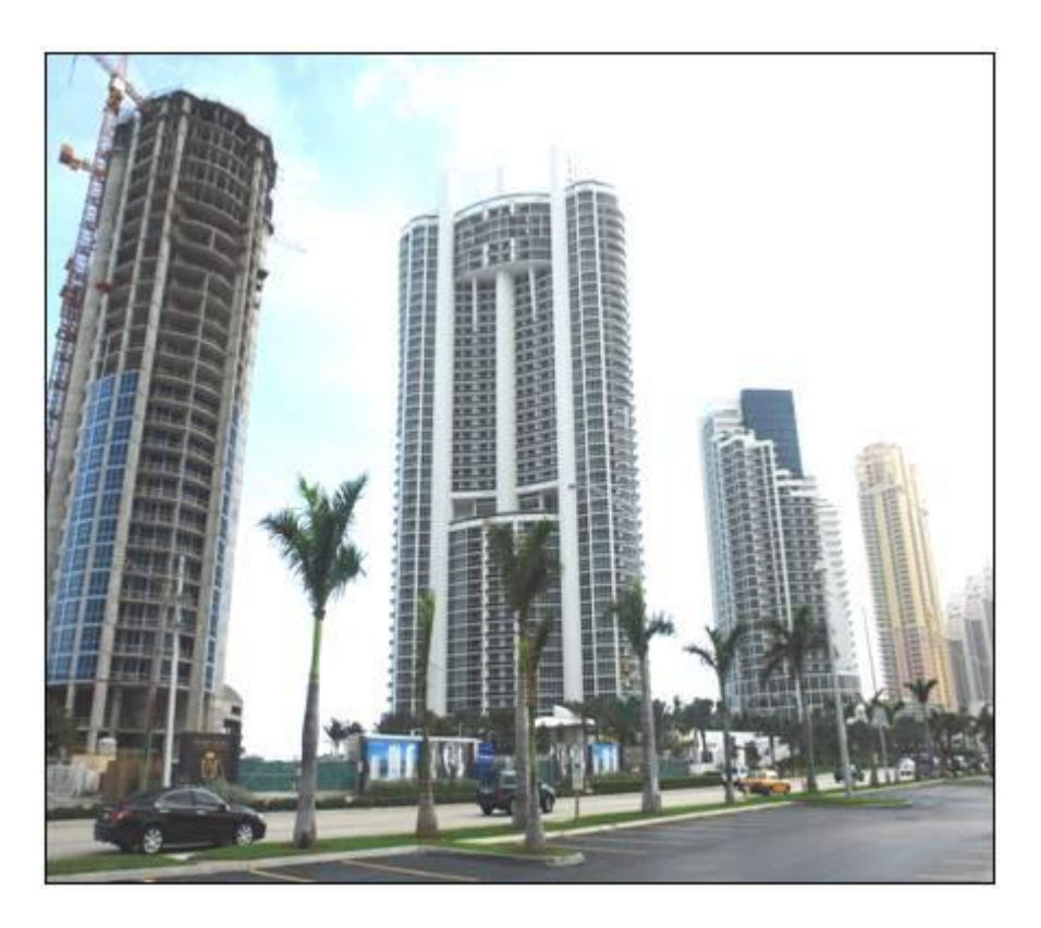
Figure 4: Towers on the waterfront in Sunny Isles. The building to the left (property of Donald Trump) was still under construction.

downtown-style suburban sprawl impacting the view from ground level and constraining access to the seaside.